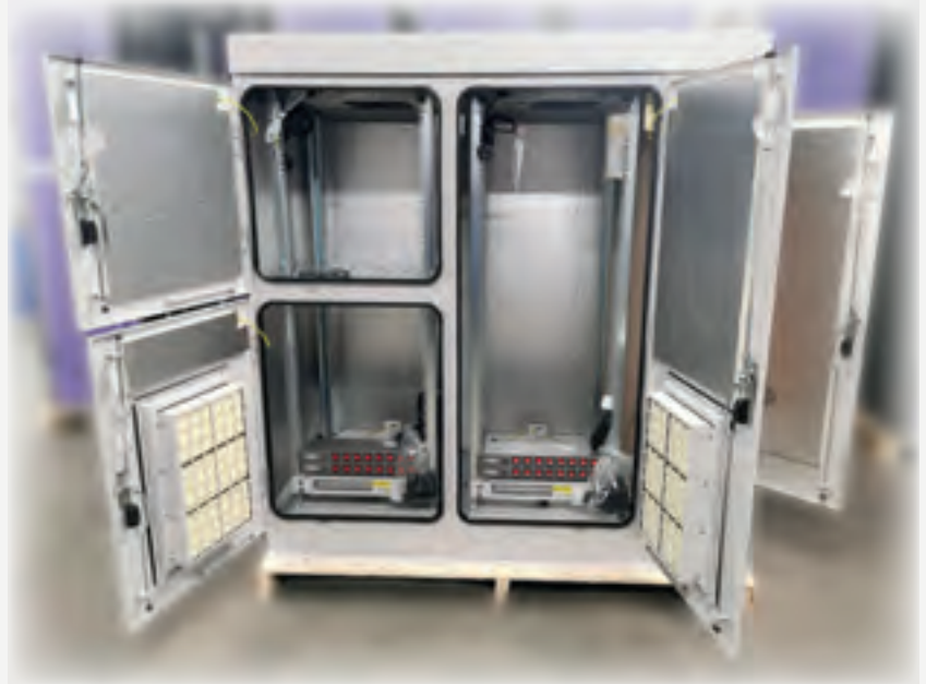
Customised Solution for housing multiple operators

Company Registration No: 05061620 VAT No: 860 2309 48