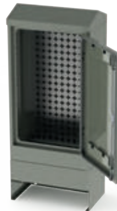
FTTH Drop Cabinet