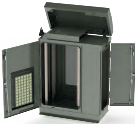
Single Bay + End Pod

Our enclosures are supplied fully assembled ready for immediate deployment.