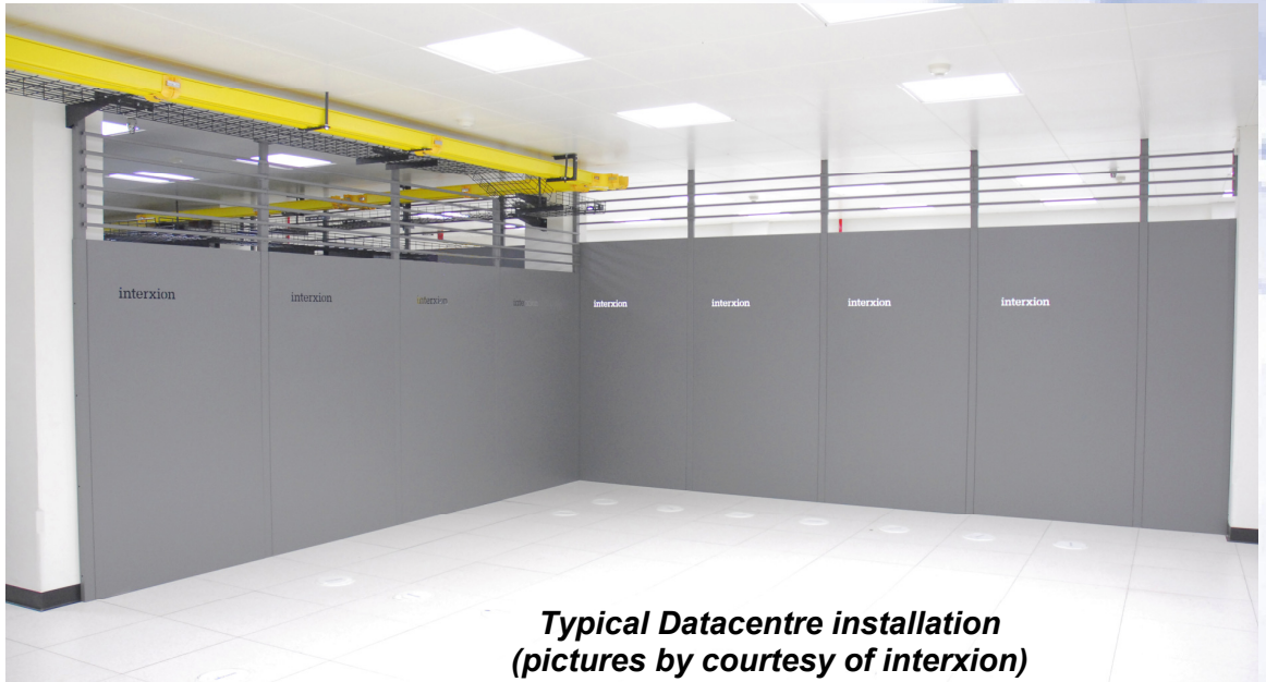
Typical Datacentre installation

Designed and manufactured in our UK factory, the system provides both above and below floor security and is tailored to suit a particular customer's specific corporate and site requirements, from corporate colours and logos through to specific site security requirements such as 'MagLocks', Card Readers and 'Auto-close' mechanisms.