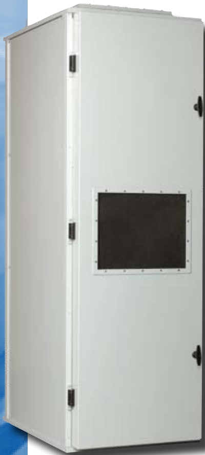
SATCOMS communications enclosure