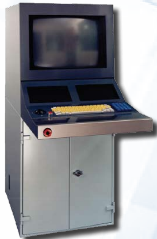
Command and Control Console